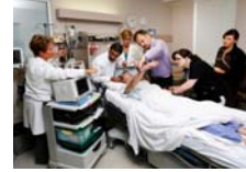
% of pts meeting 60 minute tPA door to needle target